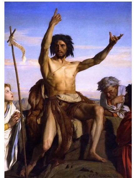
Alexandre Cabanel 1823-1889

Before we talk about the birth of Jesus, we need to talk about his cousin, John the Baptist. Like many religious people of his time, John expected the messiah to come with power. John's concern was justice and repentance. In his preaching, he warned people of an approaching time of reckoning and expected the longed-for messiah to come precisely as a violent fire, a winnowing fan that would separate the bad from the good and burn up the former with a righteousness that came straight from God. When he heard reports of Jesus gently inviting sinners in rather than turning them away, John was scandalized. That kind of a messiah didn't fit his expectations, or his preaching. That's why Jesus, in sending a response to him, invited John not to be scandalized by him. John hadn't wanted a gentle, vulnerable, peace-preaching messiah. He wanted bad people punished, not converted. But, to his credit, once he saw how Jesus' power worked, he understood, he accepted a deeper truth and then stepped back in self-effacement. He pointed people in Jesus direction with the words: