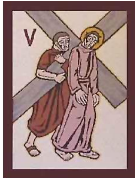
A man, Simon, helps Jesus carry his cross.

Jesus just looks at Simon and quietly whispers, “Thank you” to Simon. Then they continue on the long road, carrying the cross together.