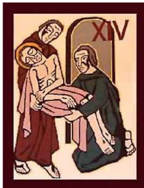
Jesus is buried.

Now there is darkness in the tomb where Jesus' body lies, and all of his friends go home because they are very sad and tired.