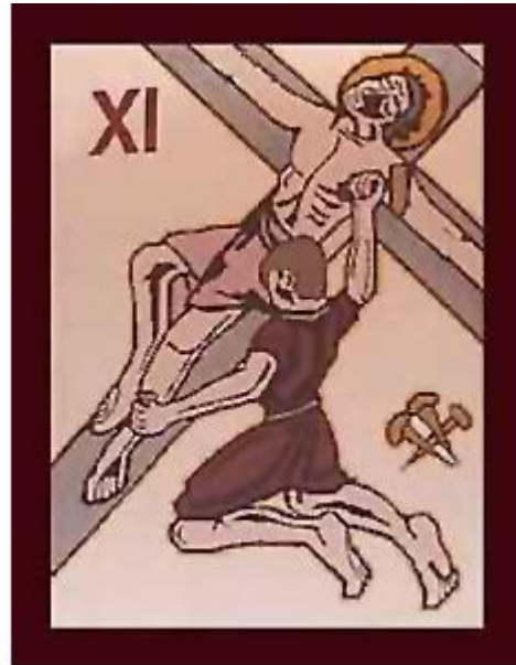
Jesus is nailed to the cross.

He looks at his mother and tells her to take care of others. Even when he is dying, Jesus is thinking of other people.