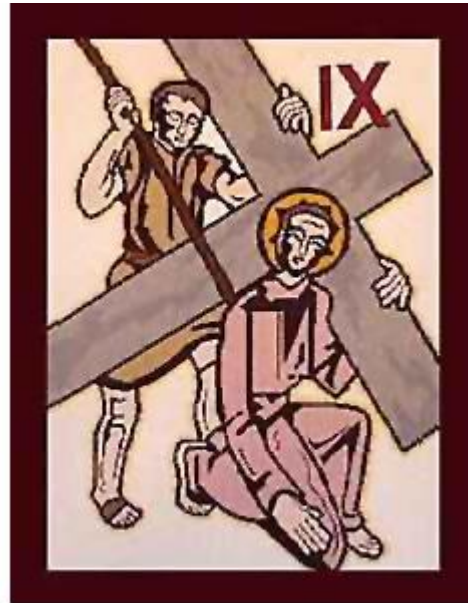
Jesus falls a third time.

Then Jesus falls down in the street for the third time. He is so very tired. Jesus asks God to help him. And Jesus gets up again, even though it is hard for him to do.