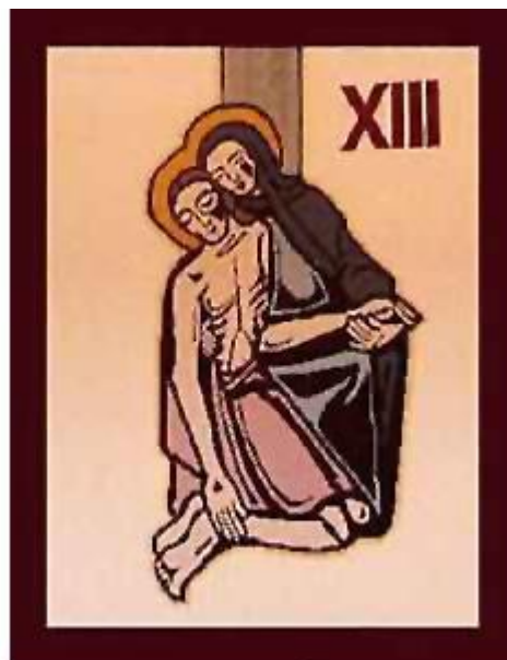
Jesus is taken down from the cross.

You can show your heart to Jesus, and show Jesus what you miss about the person who died. Jesus knows what your heart looks like, and loves you when you show him your heart. He can even help your heart become more like his.