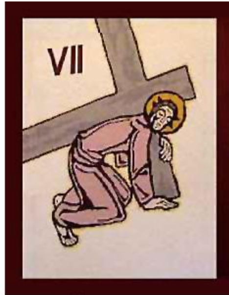
Jesus falls a second time.

When you show Jesus how your heart felt, picture Jesus loving you. Jesus knows how your heart felt; his heart probably felt the same way.