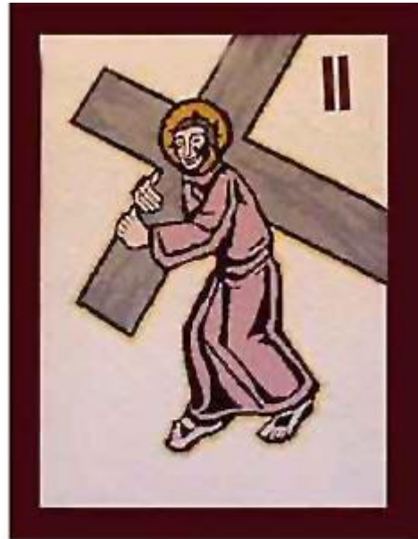
Soldiers put a heavy cross on Jesus' shoulders.

When the soldiers put a big, heavy cross on Jesus' shoulders, Jesus doesn't fight with them or say angry words to them. He knows that he has to carry this cross a long way, and he knows that the way will be very hard for him at times. But Jesus knows that God is with him, and he asks God to help him to carry this cross, even though it is heavy.