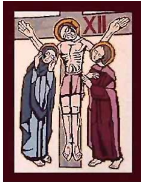
Jesus dies on the cross.

If you can think of a time like that, then show Jesus your heart, and let him love you. When you are ready, you can ask Jesus to help your heart be more like his heart.