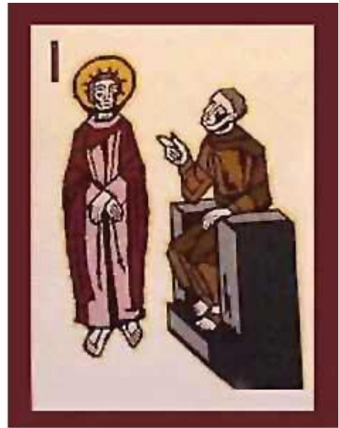
Jesus stands before a judge, Pontius Pilate. The judge tells Jesus that he will die.

But Jesus stays quiet, even though he knows that he will be hurt. He knows that God is with him. He even asks God to help him forgive the people who are yelling and telling lies about him.