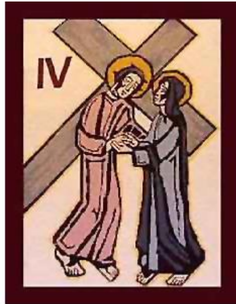
Jesus meets his Mother.

As Jesus walks slowly with the cross on his shoulders, a woman comes up to him. It's Jesus' mother, Mary. How sad for them to see each other now. Mary feels so sad because she sees how much he is suffering, and Jesus sees the sadness Mary feels. Even though they both know that God is with them, they can't even say anything to each other, because they are so sad.