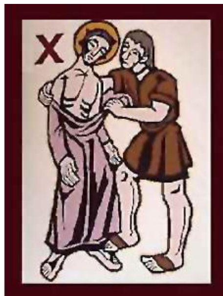
Jesus' clothes are taken away.

Jesus stands in front of the crowd with only a small piece of cloth covering part of his body. Jesus asks God to help him remember that he is not alone, that God is with him through all this.