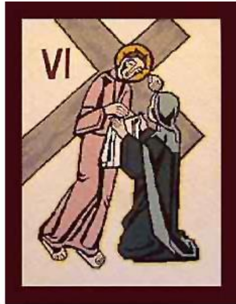
A woman, Veronica, wipes Jesus' face.

Suddenly, a woman pushes her way out of the crowd and stands in front of Jesus. She takes a clean cloth and gently wipes Jesus' face. Jesus is so thankful that he leaves a picture of his face on her cloth.