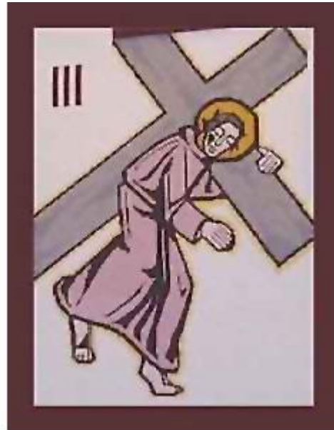
Jesus falls the first time.

Then Jesus falls, and the soldiers yell at him more. How tired Jesus is! Jesus prays in his heart, “God, help me remember that you are here.”