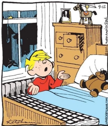
"FIRST OF ALL... DO I HAFTA ADMIT SOMETHING NOBODY CAN PROVE?"